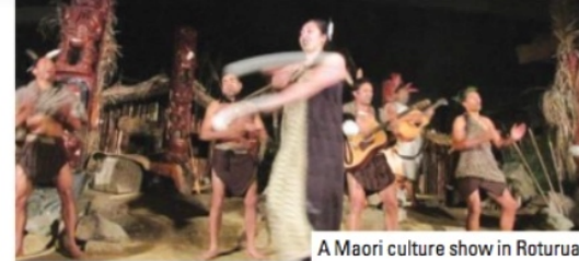
A Maori culture show in Rotorua.

While there, take a ride on the SS Earn-