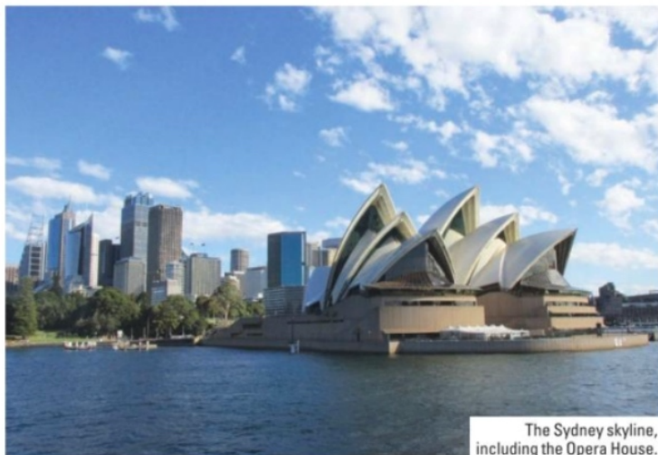
The Sydney skyline, including the Opera House.